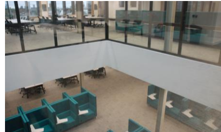
New reading rooms in Mile End Library