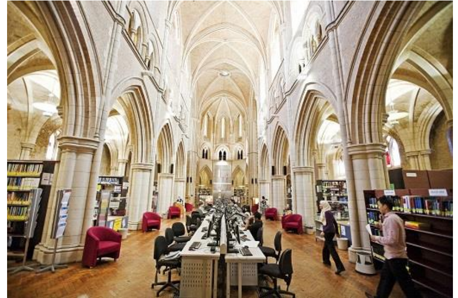
Whitechapel Library main reading room

Project timeline: July 2024 to Spring 2025