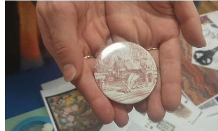
Badge making at History Day