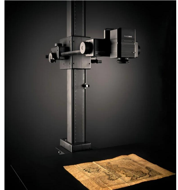
Overhead photography equipment

Estimated timeline: June 2024 to December 2025