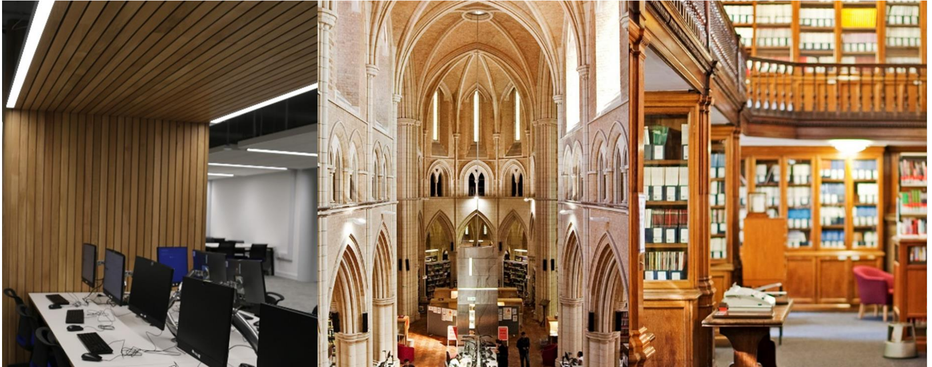
Composite image of Mile End, Whitechapel and West Smithfield Libraries