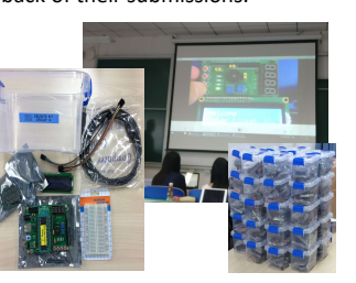
Fig 1. The hardware kits and hands-on workshop