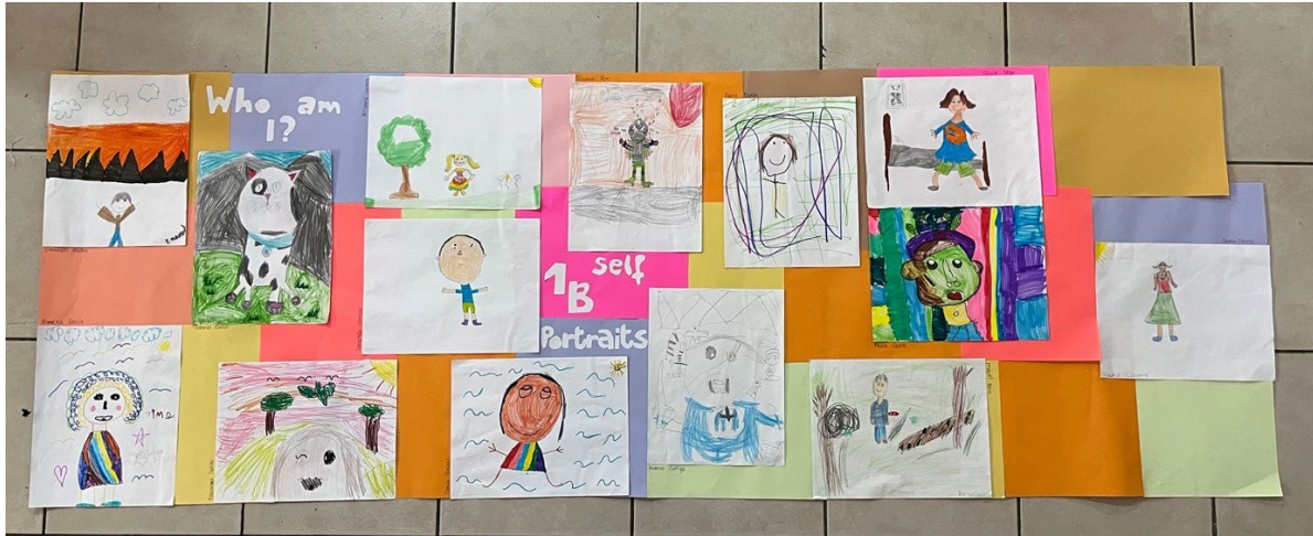
Class 1B's self portraits

This summer I spent two weeks voluntary teaching at Saint Mary School in San Jose, Costa Rica, running my own curated arts programme called 'Who am I?' to two classes of first graders. It included discussions about identity, how to describe ourselves in English, drawings and finally self-portraits. Aside from teaching two lessons a day, I also assisted in every class, including one-to-one reading, language arts, mathematics, science, technology, art and Spanish.