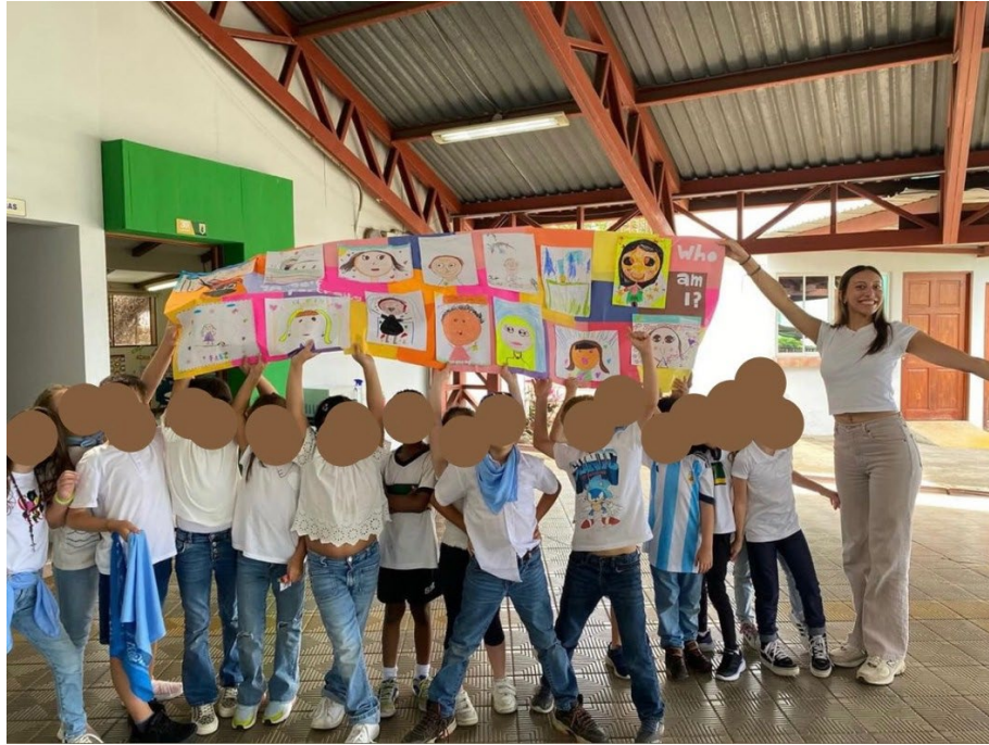
Class 1A's self portraits

Alongside teaching, I was able to indulge in the cultural festivals at the time including Anexion de Guanacaste, celebrating the anniversary of the joining of the providence of Guanacaste in North Costa Rica which used to be part of Nicaragua, La Dia de la Virgen, a Catholic holiday, La Festival de Santa Ana and El Tope, Costa Rica's horse parade. Many of these we celebrated at Saint Mary school, for example, for Anexion de Guanacaste we had an assembly of typical dance, singing the national anthem and other patriotic songs, recounted the history of this holiday and ate traditional food from Guanacaste. For La Dia de la Virgen, it is custom to take a pilgrimage, Catholics walking all over Costa Rica, some even on their knees. In the preschool and elementary school, we took a walk around the perimeters of the grounds of Saint Mary and enjoyed an assembly from the local priest.