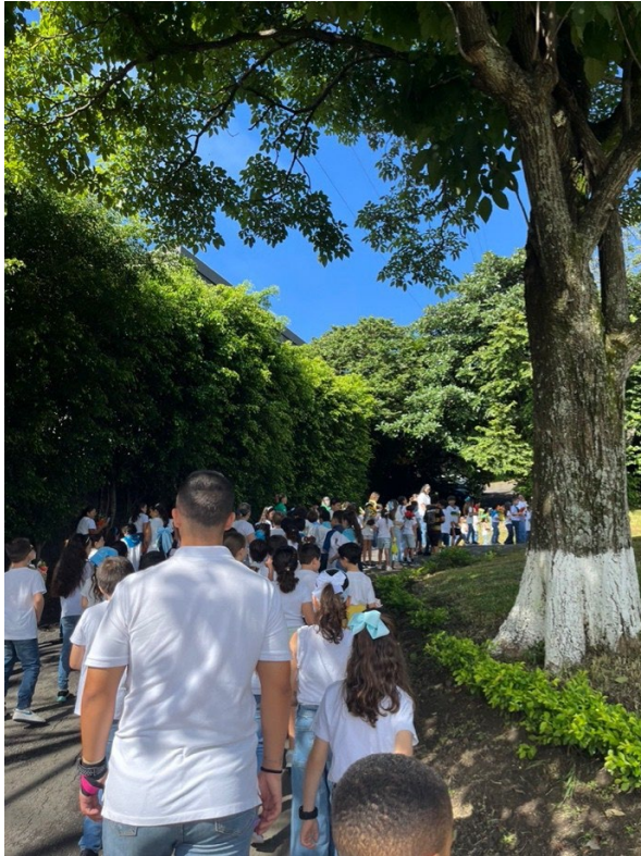
La Dia de la Virgen at Saint Mary