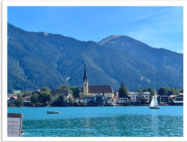
Figure 3: Tegernsee, Germany

One of the highlights was my visit to Partnachklamm, a deep gorge near the German/Austrian border. The experience of seeing and feeling the sheer power of the water was one I will never forget.