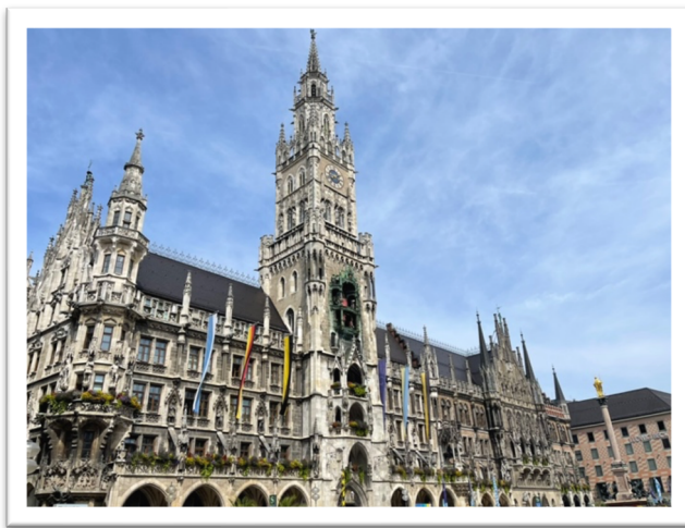
Figure 1: Neues Rathaus (New Town Hall), Munich, Germany

this industry exposure will facilitate a smoother transition from university to the professional domain following my final year at QM.