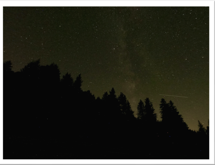
Figure 4: Gasthaus Edelweißhütte, Villnöß, Italy

In summary, I am convinced that the enriching experience of living and working abroad during the summer has not only added depth to my academic knowledge but has also contributed significantly to my personal development, creating enduring memories and establishing a solid foundation for future success.