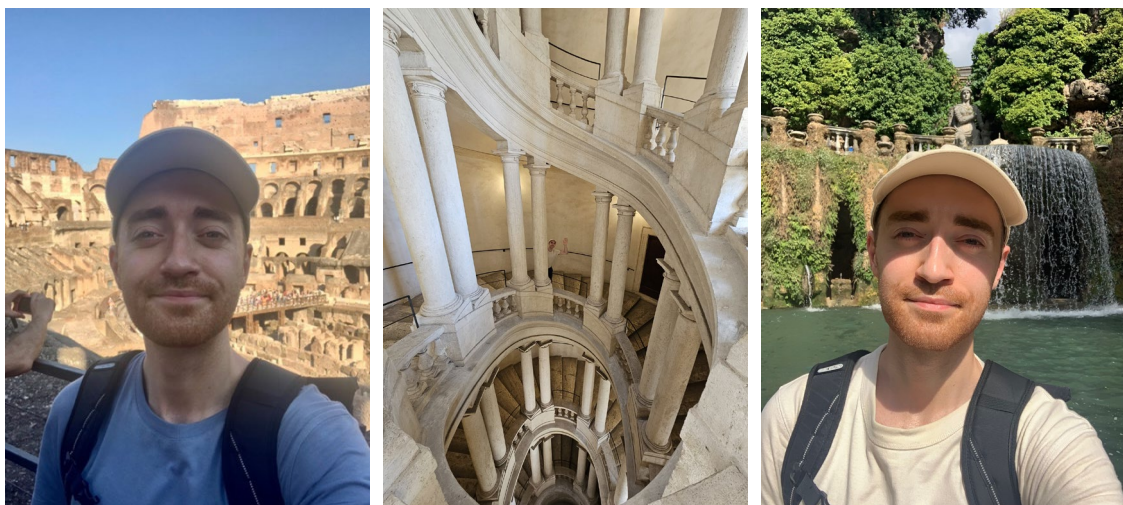
Photos from the Colosseum, Palazzo Barberini and Villa D'Este (Tivoli)

Within Rome, I took full advantage of the opportunity to visit the city's historical sites, including the Colosseum, the Vatican, the Roman Forum and the Pantheon. These were all captivating, providing insights into the country's rich history that boosted my enthusiasm for Italy's language and culture. On the weekends, I also took longer day trips. This included a trip to Tivoli, thirty kilometres northeast of Rome, which contained some extraordinarily beautiful villas designated as UNESCO world heritage sites.