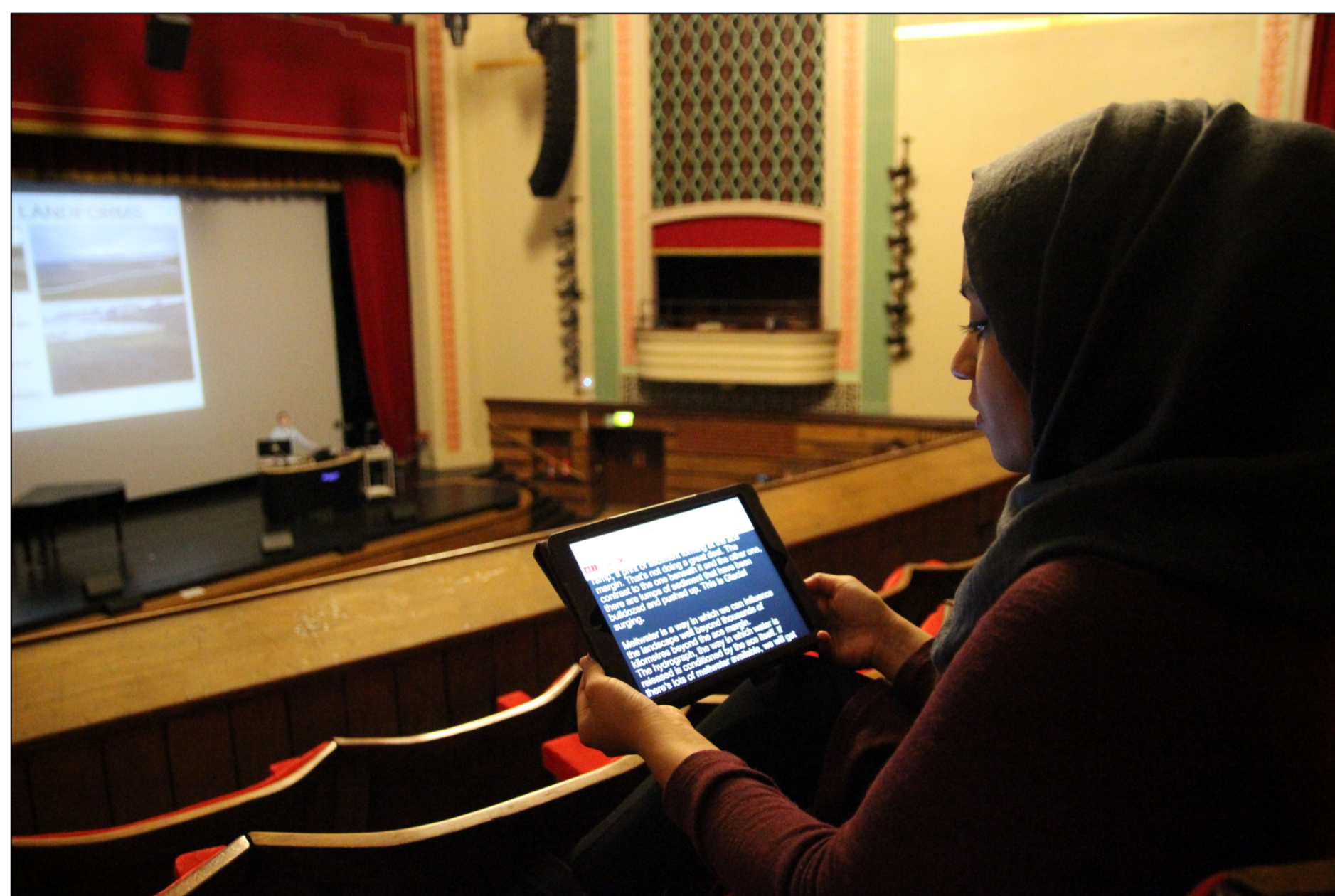
Student reading closed caption 'subtitles' of the lecture on tablet, during class.